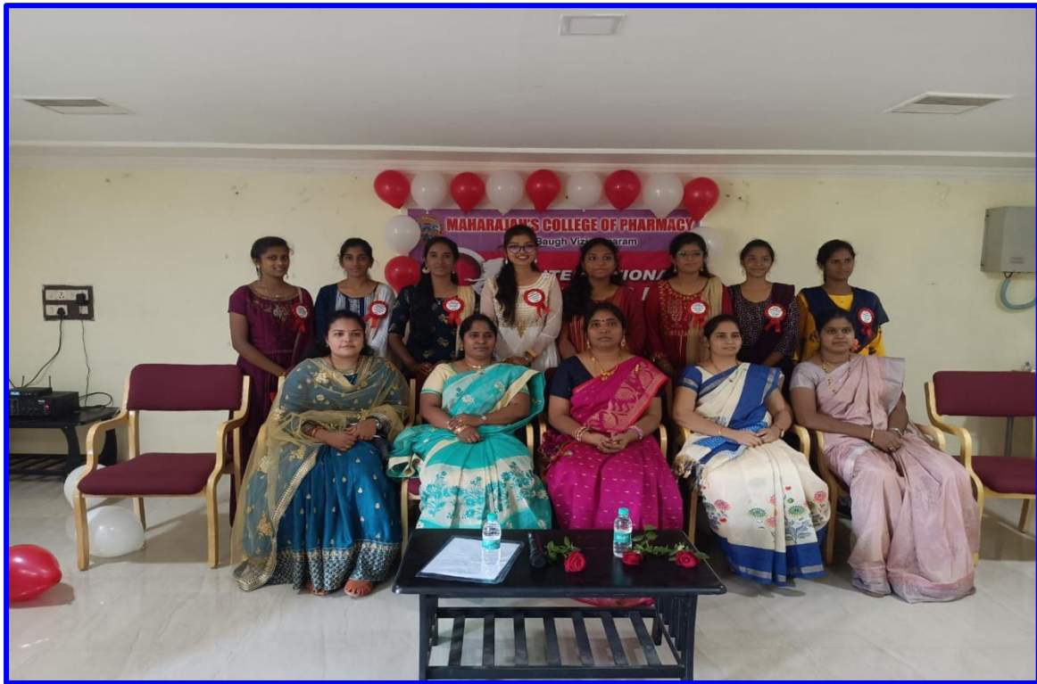
WOMEN EMPOWERMENT CELL MEMBERS LIST