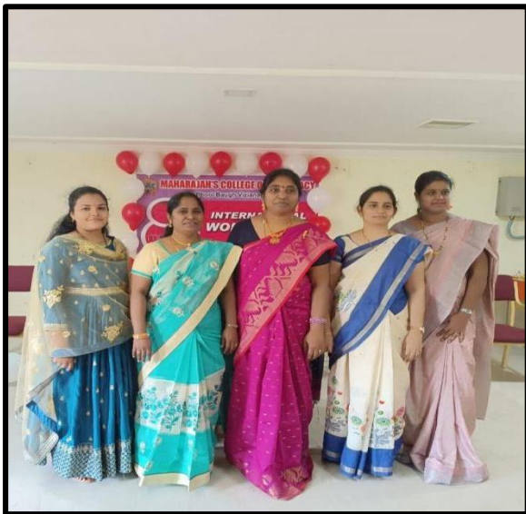
WOMEN EMPOWERMENT STAFF