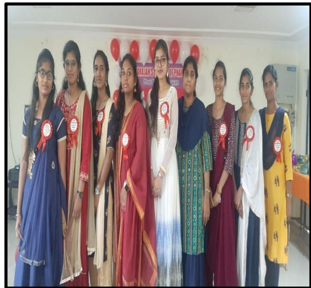
WOMEN EMPOWERMENT STUDENTS