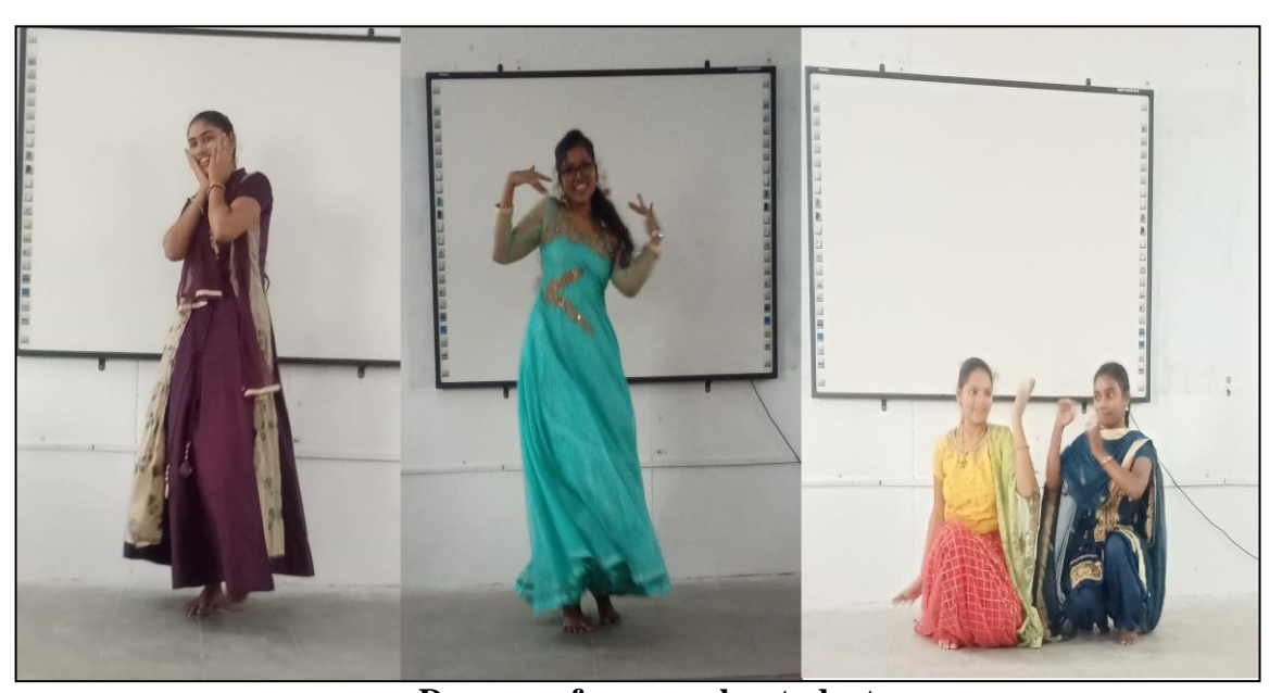
Dance performance by students.