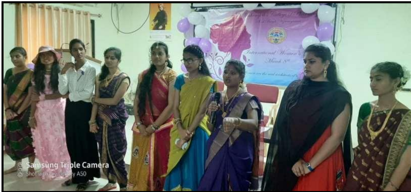
Ms. Pharmacy Competition