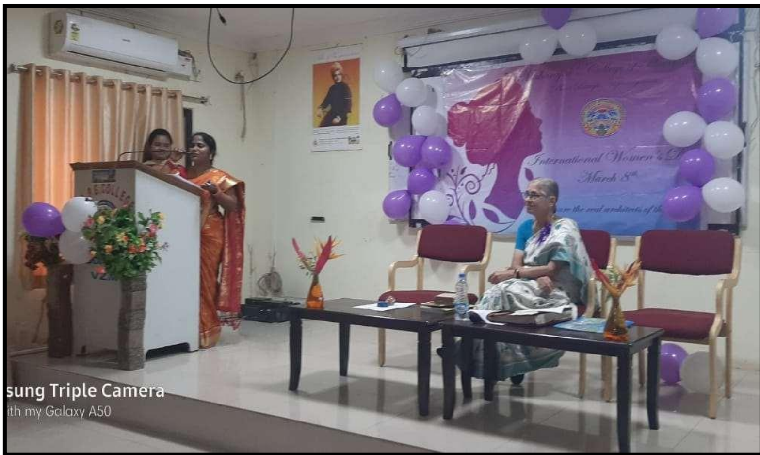
sung Triple Camera ith my Galaxy A50